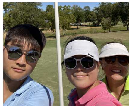
PAR! (I HOPE)