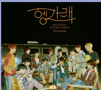
Left & Right by SEVENTEEN