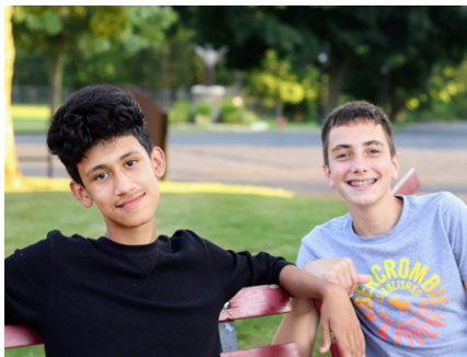
SMILE FOR THE CAMERA!