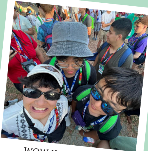
WOW YOU'RE TALL!