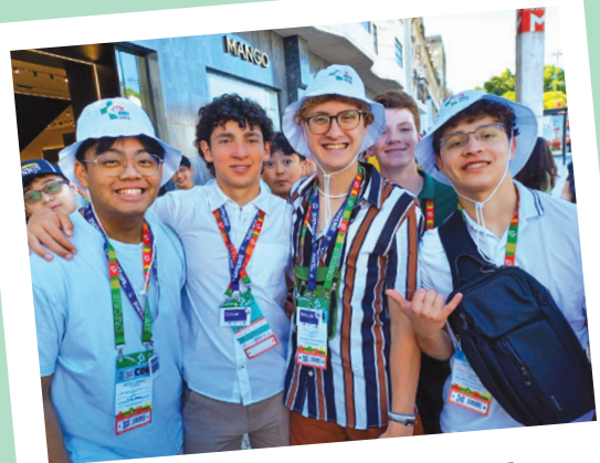
LISBON'S PRETTY COOL