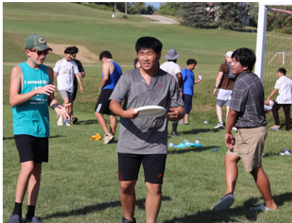
WHY IS IT SO BRIGHT?!