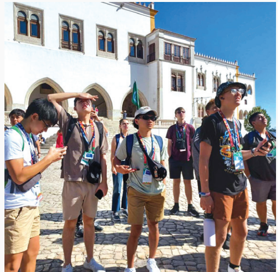
WHERE ARE THE CASTLES?