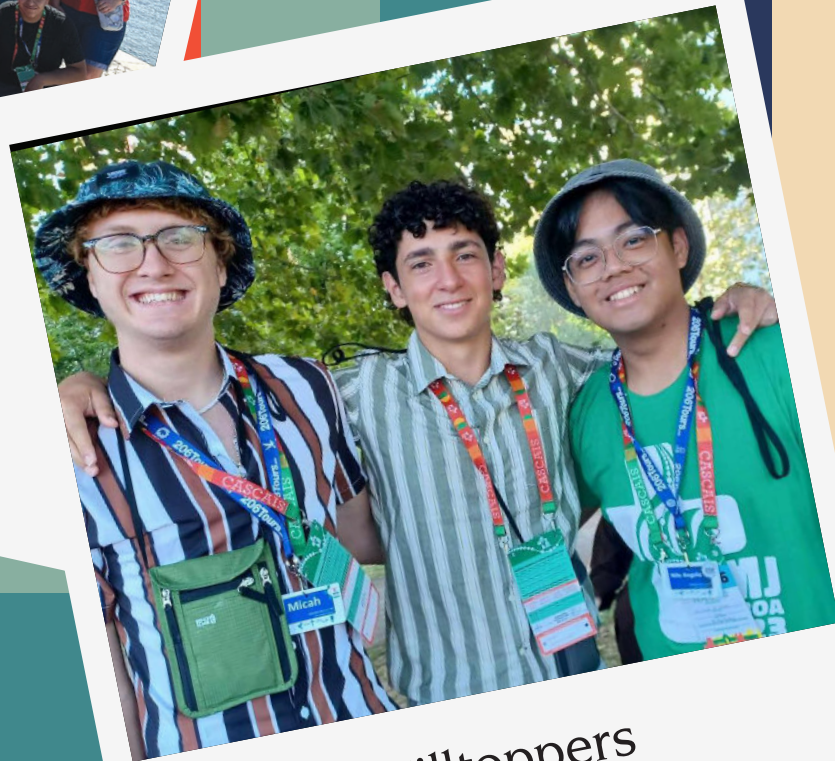
Hilltoppers Across the Ocean