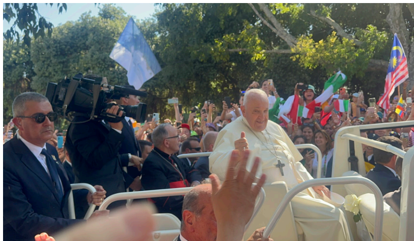
POPE FRANCIS APPROVED!

The SLS students and staff have treasured memories that were made together. The Pope made a huge impact on everyone's trip. This past summer was unforgettable!