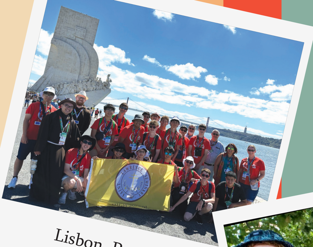
Lisbon, Portugal ft. The Pope!