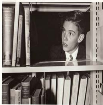
The face of curiosity and wonder.